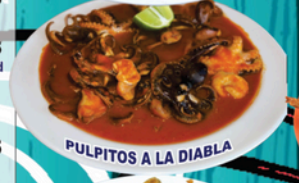
PULPITOS A LA DIABLA