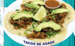
TACOS DE ASADA