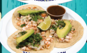
TACOS DE CAMARON