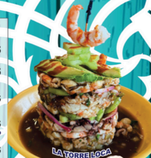
LA TORRE LOCA

★ THESE ITEMS MAY BE SERVED RAW OR UNDERCOOKED, OR CONTAIN RAW OR UNDERCOOKED INGREDIENTS. CONSUMING RAW OR UNDERCOOKED MEATS, POULTRY, SEAFOOD, SHELLFIS OR EGGS MAY INCREASE YOUR RISK OF FOODBORNE ILLNESS