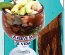
VUELVE A LA VIDA