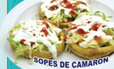
SOPES DE CAMARON