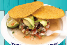
TOSTADA DE CEVICHE